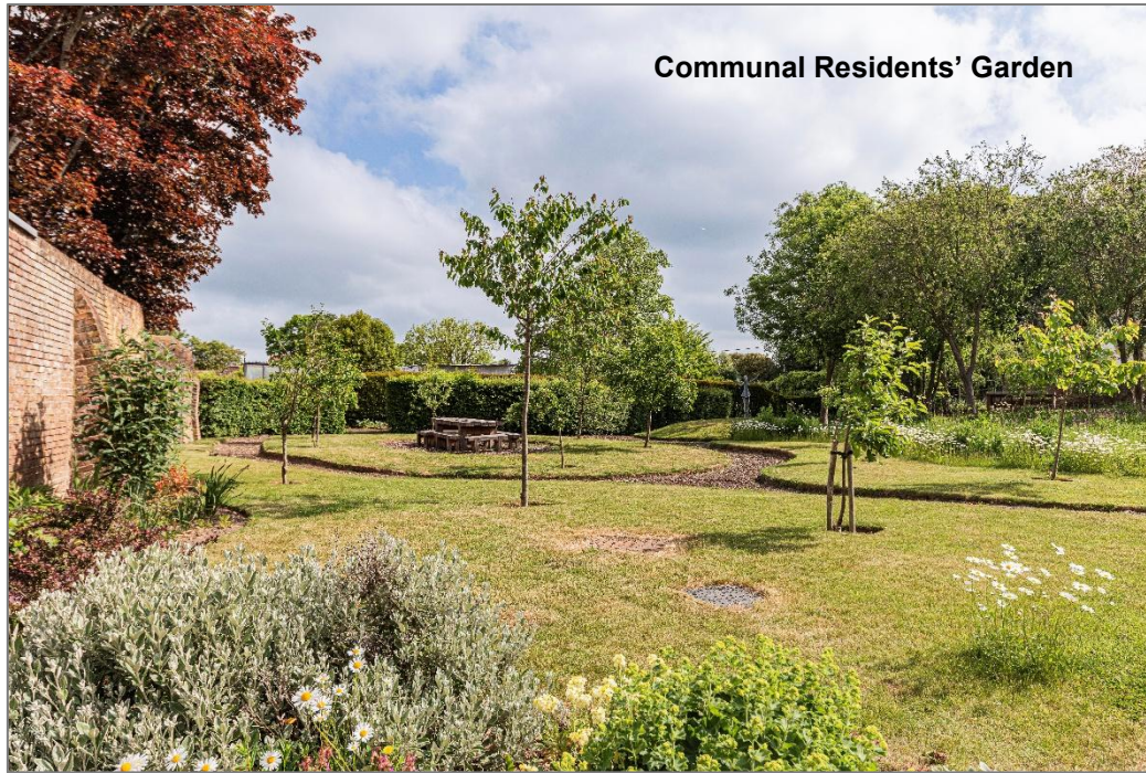
Communal Residents' Garden